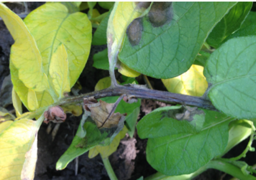
FIGURE 12. Late blight symptoms on leaves