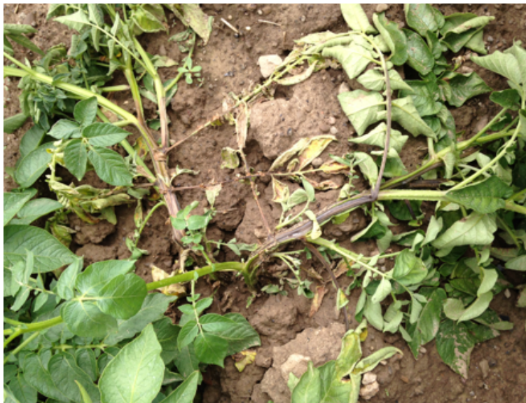
FIGURE 1. Typical blackleg infection