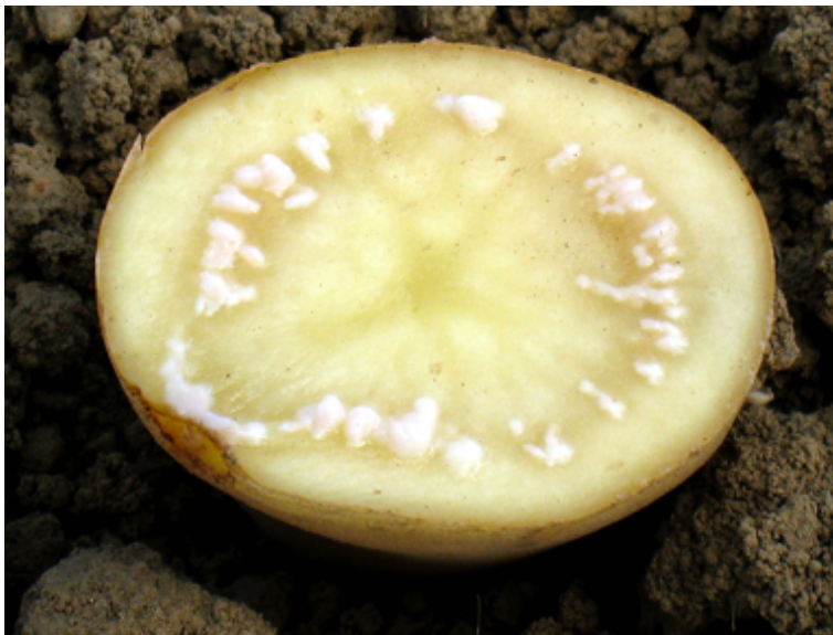
FIGURE 6. Gray brown discoloration of vascular tissues and bacterial ooze in potato tuber infected by Ralstonia solanacearum race 3 biovar 2.