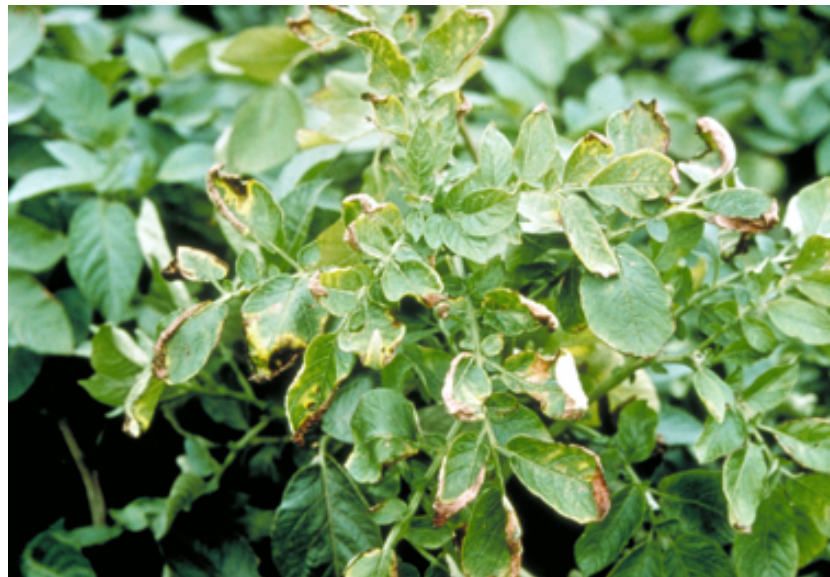
FIGURE 4. Above ground symptoms of ring rot