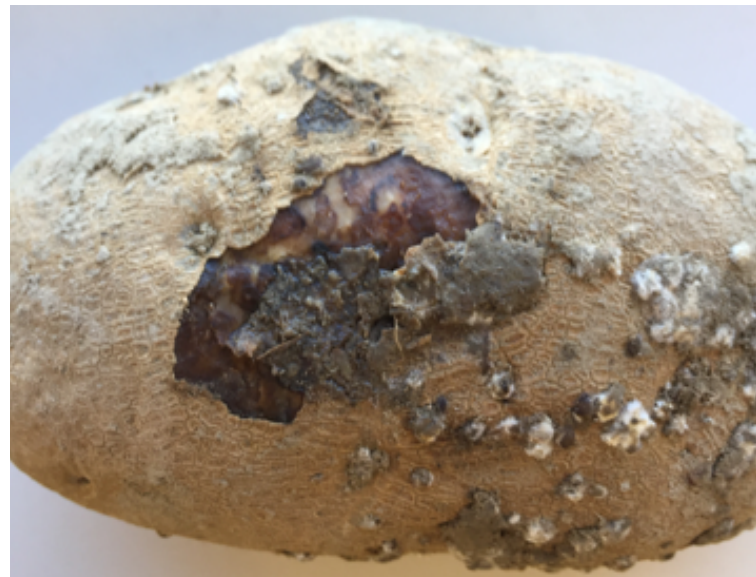
FIGURE 13. Late blight symptoms on tuber