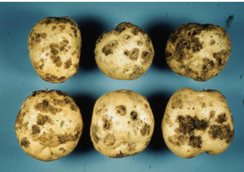
FIGURE 8. Symptoms of common scab on potato tubers