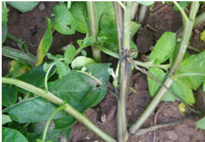
FIGURE 7. Dickeya blackleg