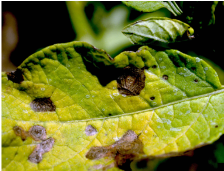
FIGURE 10. Early blight symptoms