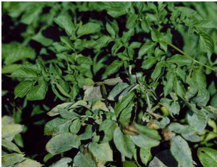
FIGURE 14. Powdery mildew of potato

Zoospores: a spore capable of swimming using a flagellum