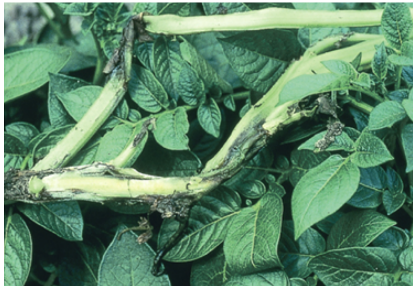
FIGURE 2. Aerial stem rot following hail event