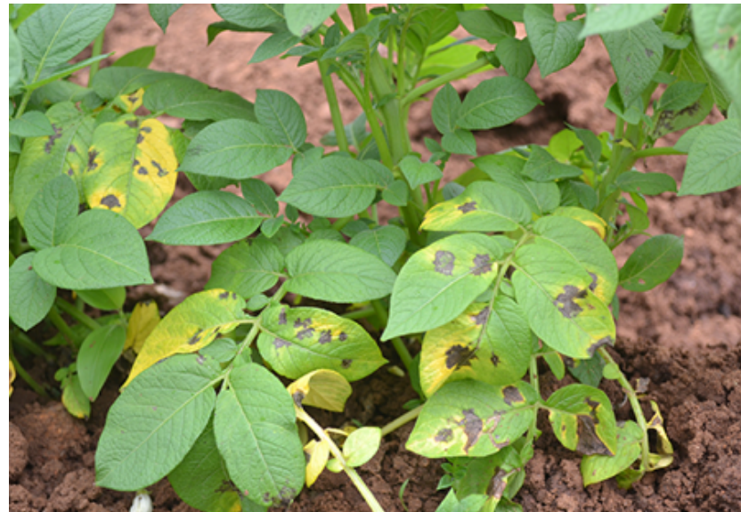
FIGURE 11. Early blight infection of potato plant