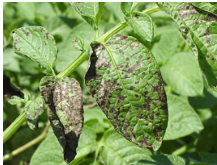
FIGURE 9. Alternaria brown spot on leaf tissue