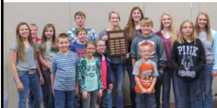
Congrats to the Forever Buds 4-H Club for being named the Club of the Year