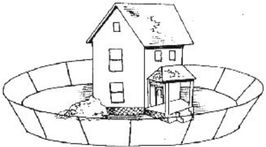
Fig. 1. Though fairly expensive, a snake-proof fence can keep snakes from entering an area

San Julian, G.J., and D.K. Woodward. 1985. What You Wanted to Know About All you Ever Heard Concerning Snake Repellents . Proc. Eastern Wildlife Damage Control Conference 2:243-248. A scientific but readable article describing studies of home remedies as snake repellents; none were effective.