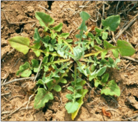
FIGURE 2. Rosette of yellow starthistle.