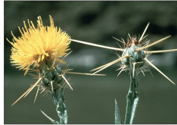
FIGURE 4. Yellow flowers with long spines ( \frac{3}{4} to 1 inch) on the receptacles.

plumeless (Figure 6). Plumes are fluffy appendages that may facilitate dispersal by wind, exemplified by those on dandelion. By producing two seed types that differ in how and when they disperse, or their ideal conditions for germination, plants may increase their chances for new populations to establish.