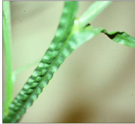
FIGURE 3. Flattened or winged stems.