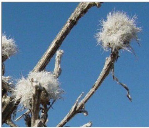
FIGURE 5. Cottony tufts remaining after seed dispersal.