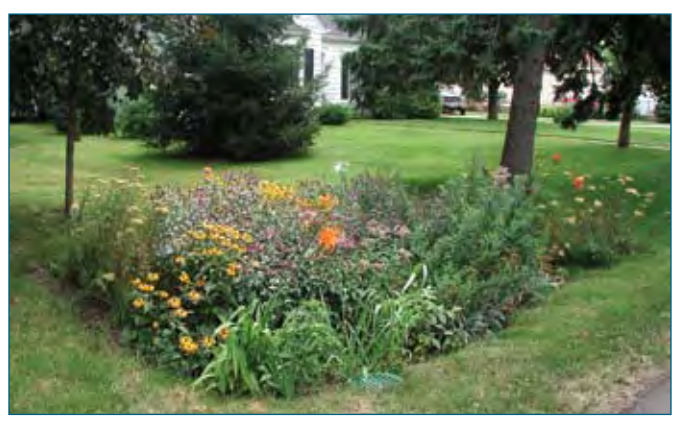
Native landscaping adds color, structure, and diversity to the landscape and provides habitat for butterflies.

A rain garden is an example of the low impact development (LID) approach to storm water management. Traditionally, storm water management has involved the rapid conveyance of water via storm sewers to surface waters. Low impact development is a different approach that retains and infiltrates rainfall on-site. The LID approach emphasizes site design and planning techniques that mimic the natural infiltration-based, groundwater-driven hydrology of our historic landscape.