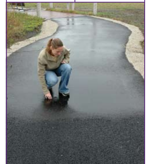
A walking path includes both porous asphalt and non-porous asphalt. The porous asphalt allows rainwater to infiltrate while the non-porous surface has standing water.